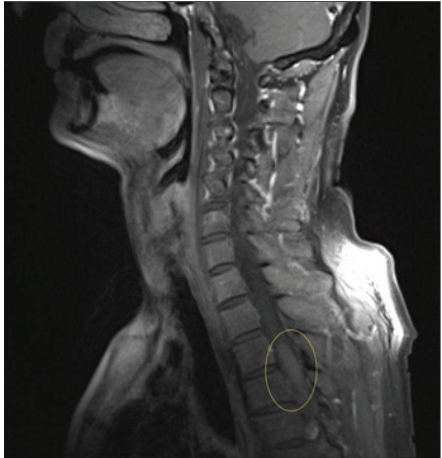
Fig. 1. Thoracic lesion on an MRI scan in November 2024.

Due to persistence of CSF involvement by MCL cells after one cycle of MATRIX regimen and one month of ibrutinib therapy with another four intrathecal applications, the patient was referred for CAR T-cell therapy with brexucabtagene autoleucel. Mononuclear cell collection was performed in March 2025. The dynamics of CSF involvement by pathological lymphocytes are shown in Fig. 2. Following lymphodepletion with fludarabine and cyclophosphamide, CAR T-cell therapy was administered in April 2025. The patient's hospital stay was complicated by grade I cytokine release syndrome, as defined by the American Society for Transplantation and Cellular Therapy, as well as by prolonged pancytopenia (moderate anemia, severe